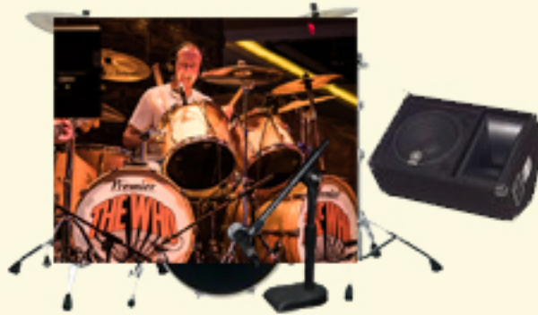
Minimum 4 (K, K, Sn, OH) preferably 8 (add 3 tom mics and second OH)