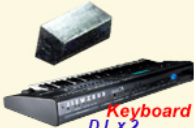
Keyboard D.I. x 2 Keys Sequencer