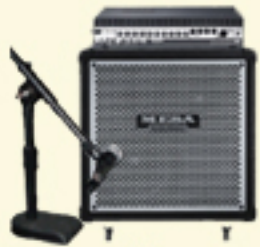
Bass Ln.Out - XLR

One head amp with XLR direct out Two cabinets stacked atop one another