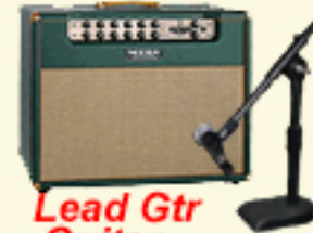
Lead Gtr Guitar Shure SM57 Ln.Out XLR

I supply 2 mono sends to FOH - Keyboard and Sequencer.